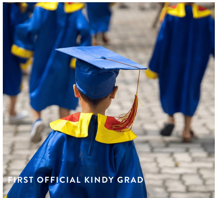
FIRST OFFICIAL KINDY GRAD