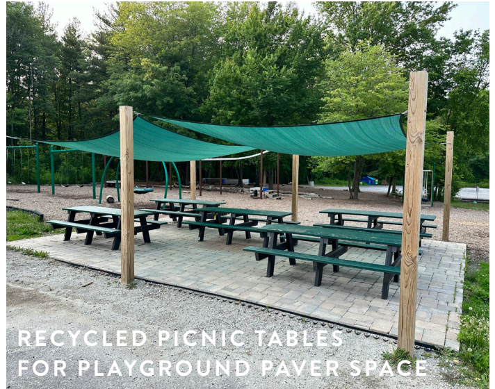
RECYCLED PICNIC TABLES FOR PLAYGROUND PAVER SPACE