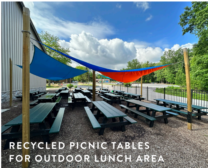
RECYCLED PICNIC TABLES FOR OUTDOOR LUNCH AREA