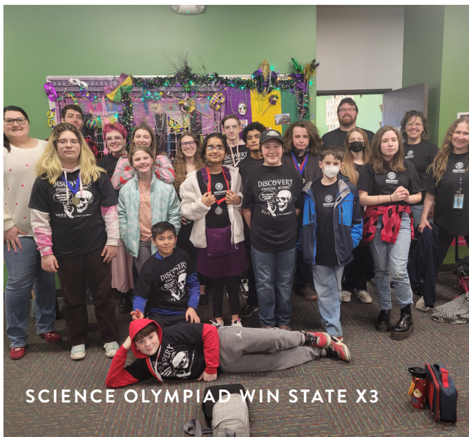
SCIENCE OLYMPIAD WIN STATE X3