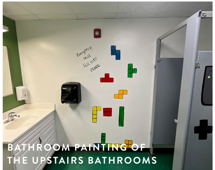
BATHROOM PAINTING OF THE UPSTAIRS BATHROOMS