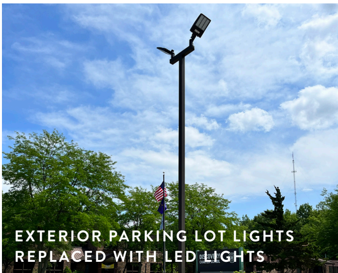
EXTERIOR PARKING LOT LIGHTS REPLACED WITH LED LIGHTS