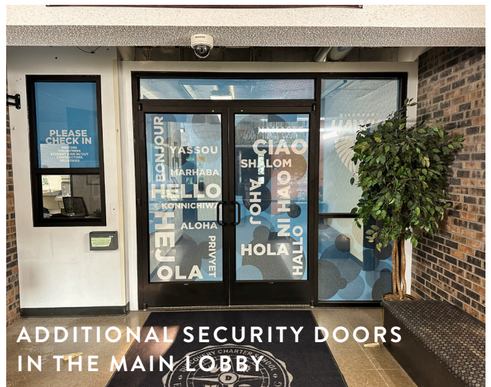
ADDITIONAL SECURITY DOORS IN THE MAIN LOBBY